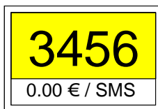
Figure 2: Choice of colours